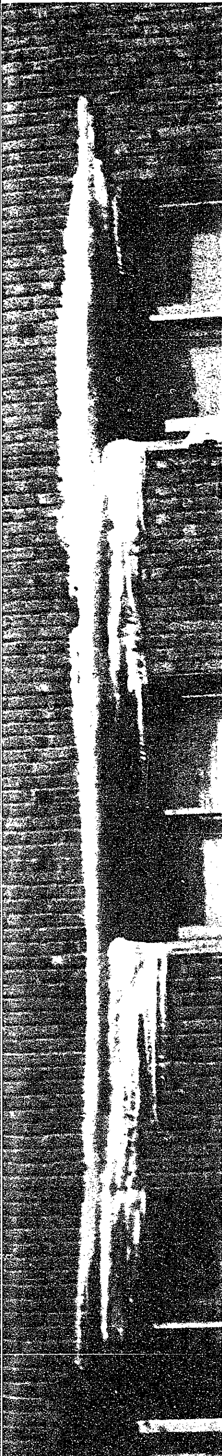
The icicle, rapidly melting in the balmy Cambridge atmosphere.